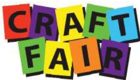
Table rental $25.00

Our Second Annual Christmas Craft Fair will take place Saturday, December 3