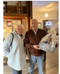
Lucky winners in our November Craft Sale draw

MANY THANKS to the vendors and shoppers who helped us raise $900 for our programs.